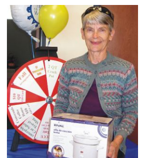
Nancy Norman: 2 Qt Crock Pot